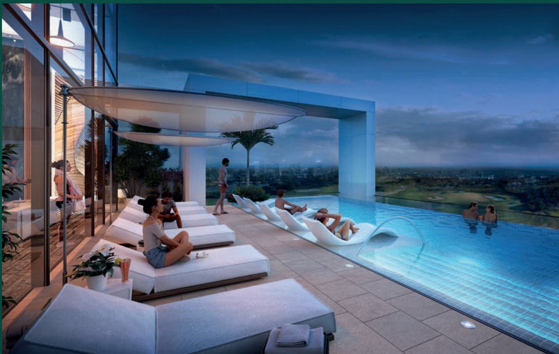
Infinity Edge Pool